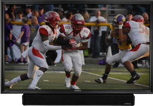
Apollo AE5550 55 Enclosure with OSB3800 Soundbar

A game-changer from down and back firing speakers, the Apollo Soundbar allows you to, once again, actually face the sound from your favorite programs.